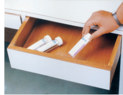
Incubate (in a warm place)